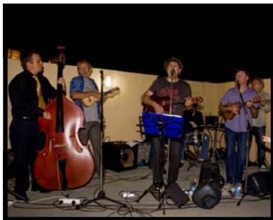
The official band.....