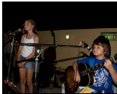
The impromptu bands (they were great!).....