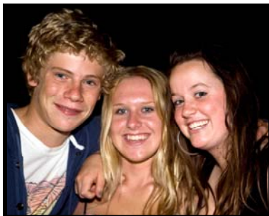
.....and the groupies!