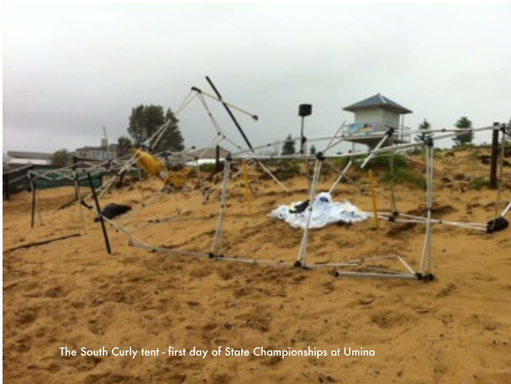
The South Curly tent - first day of State Championships at Umina