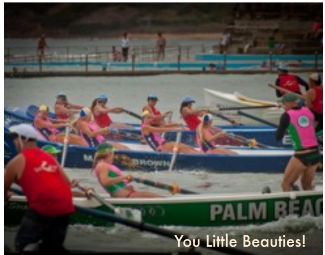
You Little Beauties!