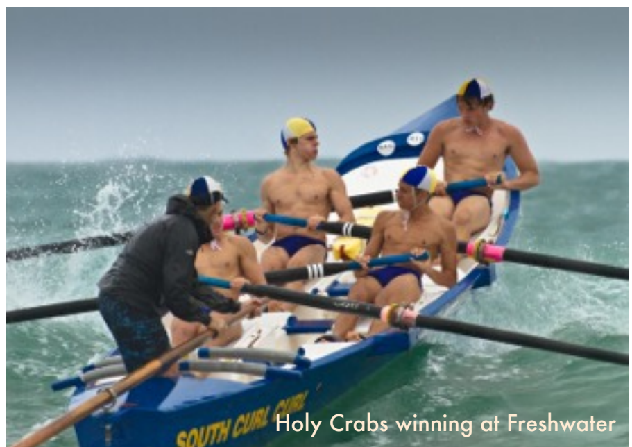
Holy Crabs winning at Freshwater